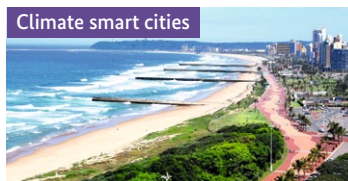
Climate smart cities