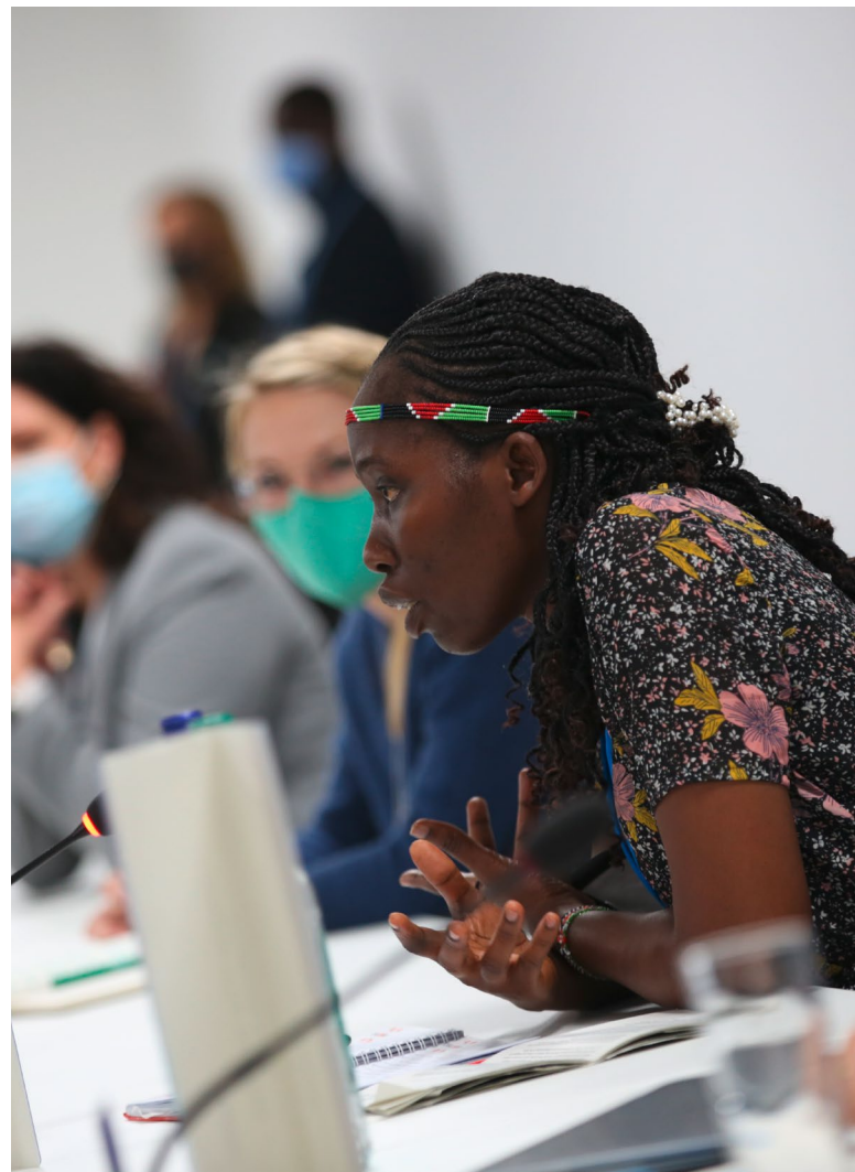
Discussion taking place during the Gender Day at the 2021 World Climate Change Conference in Glasgow (COP26).