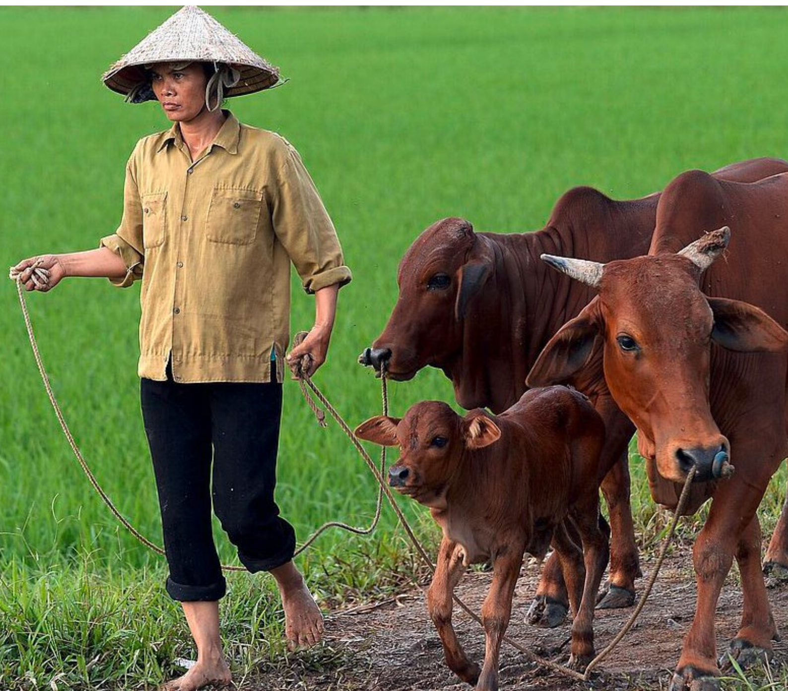
Female farmer in Vietnam: IKI advocating for sustainable and inclusive agriculture.

especially important role in this context as it can be a decisive starting point for monitoring and safeguarding the health of ecosystems. Here, too, it is important to involve the entire local community, particularly in decisions on resource utilisation, in a gender-differentiated and inclusive approach. At the same time, the loss and degradation of biodiversity do not affect all members of the groups concerned equally. Women and other marginalised groups are often disproportionately affected, thus reinforcing disadvantages and inequalities. The establishment and monitoring of protected areas present a particular challenge in biodiversity conservation. The key to effective and low-risk projects are innovative, community-based approaches that are gender-sensitive.