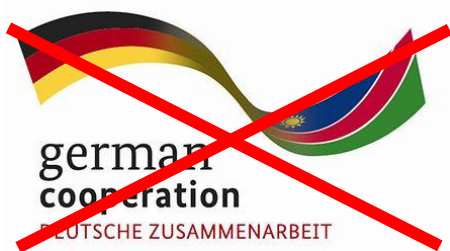
Sample version of German development cooperation logo – Namibia

Any versions of this logo already in use must be removed from websites as well as other IKI project media and products, except in cases where the effort required to do so would be unjustifiable.